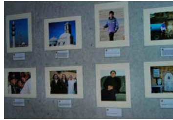
Just a small taste of If They Had Faces.