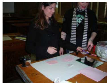
Last semester, the Art Club sponsored a Kiss a Canvas event.

We have been offered a chance to define what it means to be an SC-BU student. We should begin writing that legacy now, not next semester.