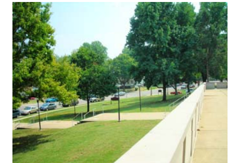
Kermit lied. It is, in fact, easy being green.

environment, and improving the quality of life for everyone, resident and visitor alike, whose backbone is its partnership with local businesses and volunteers."